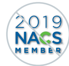
Do not add drop shadows.