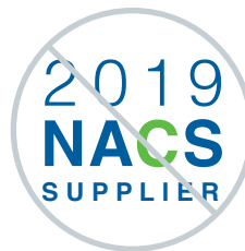
Do not re-typeset with a different font.