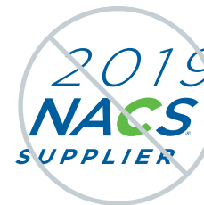
Do not stretch or skew.