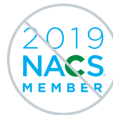
Do not change colors.