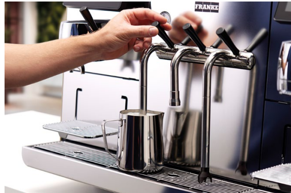
Caption 3: The Barista-Levers are customizable for quick dispense of favorite beverages or convenient functions such as steam wand purging.