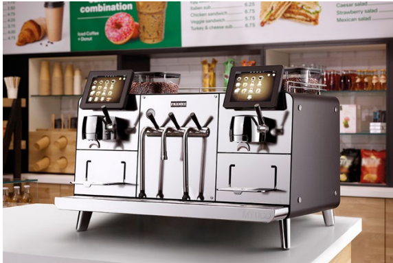
Caption 1: Mytico Due featuring a side panel in the color, Onyx. Choose your favorite look from six color options.