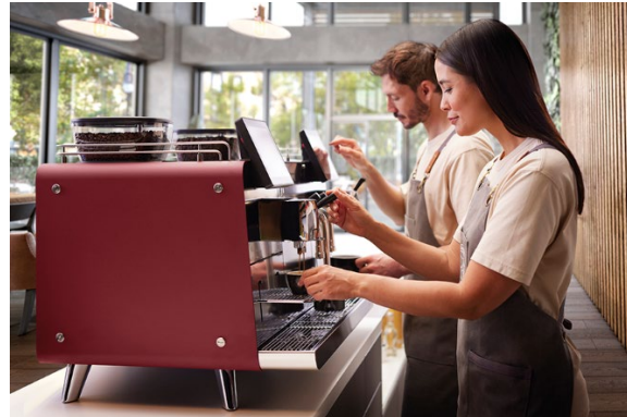
Caption 2: Four grinders, each with dedicated hoppers, and the ability to blend coffees between the two hoppers on either size, maximize variety.