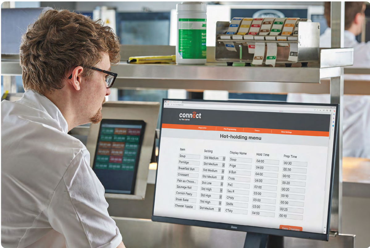
Get real-time data insights for your hot-holding program with Connect